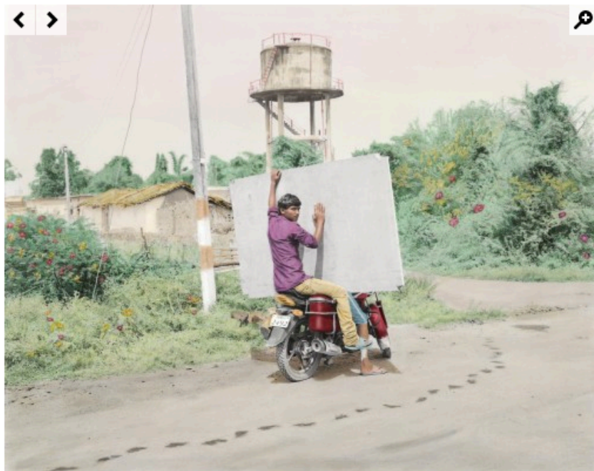
The Riders Barnawapara Sanctuary, Chhattisgarh, Indien, 2017